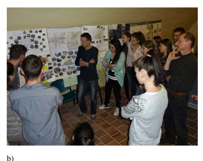
Figure 4: Presentation and discussion of student design projects within the ARCHilab framework.

In co-operation with a professional psychologist, training has focused on teamwork, team leadership and professional communication with the client. The training was based on a project-based learning approach [4]. Students were divided into groups whose members assumed the roles of architect, client and the staff of an expert body, who assessed and approved their work. In set situations, they explored the tools of communication, argumentation and conflict resolution.